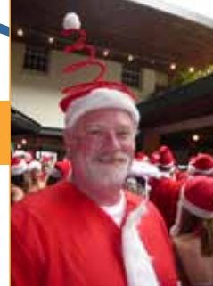
Me at the 'apres CC' Santa Pub Crawl in aid of Stewart House