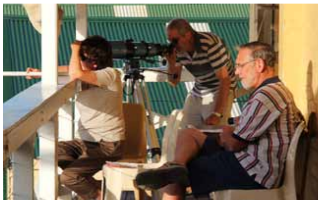
Summer Series starters concentrating hard.